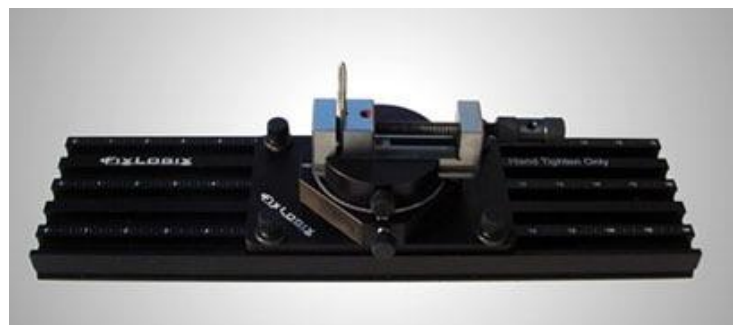
Optional Rotary Vise shown